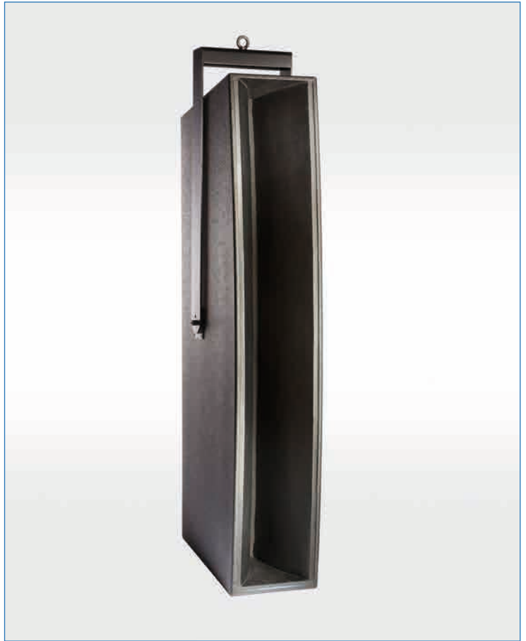
Sector SC25 Speaker

APG recommends the use of the following subwoofers: SUB238S, TB115S or TB215S.